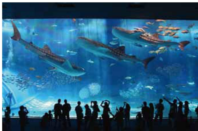
Ocean Expo Park / Okinawa Churaumi Aquarium