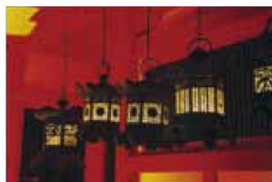
Kasuga Taisha Shrine