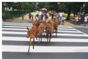
Nara Park 写真: 木村昭彦 上記すべて写真提供: 奈良市観光協会

Reservations possible until 3 days before departure