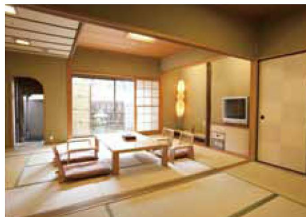
Green Plaza Hotel / Japanese-Style room